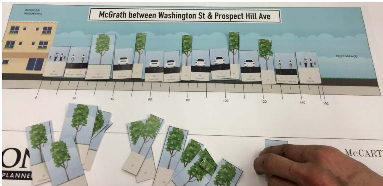
An image from a MassDOT public workshop showing a roadway design activity. Participants composed their own preferred cross sections for a new McGrath Boulevard using components from “StreetMix” a web-based tool for developing street sections.