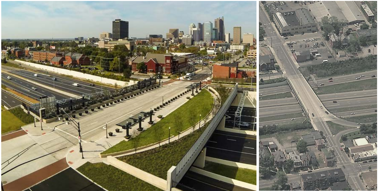
Aerial photograph of Long Street Bridge and Cultural Wall installation, over I-70/I-71, showing the expanding bridge width, art installation, and expanded sidewalks and landscaping along both sides of the roadway (left image) and an aerial photograph of the original bridge with a narrower profile and no landscaping and minimal pedestrian space (right image).

Discussion: The meeting attendees asked each other which communities may benefit from different approaches to public engagement. Perhaps, some proposed, it would be beneficial to speak to some community members with disabilities—even to tour their neighborhoods with them to experience how they navigate existing infrastructure—to ask how to meet or go above and beyond Americans with Disabilities Act (ADA) requirements for sidewalks, curb ramps, traffic signals, and other elements that contribute to detract from mobility. Further, it was suggested that MnDOT solicit assistance from the U.S. Access Board, a federal agency that promotes equality for people with disabilities, via reports, advocacy, and workshops.