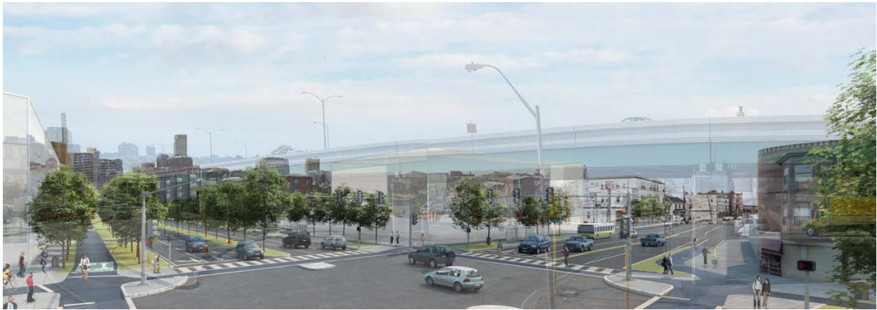
Rendering of a proposed reconfiguration of McGrath Highway, showing a ghosted image of the existing elevated structure in the background, and a multiway boulevard with separated bike lanes, sidewalks, and landscaping in its place.

Geographic Information Systems (GIS) can play a critical role in consolidation, analysis, and presentation of various data in map format. Data can include area-based information, such as regional demographics and land use; or network-based information, such as street network density, traffic volumes, and “travel-shed” data. The latter information communicates about street connectivity and access by showing distances that can be reached from a central location, based on different street connection options and mode choices.