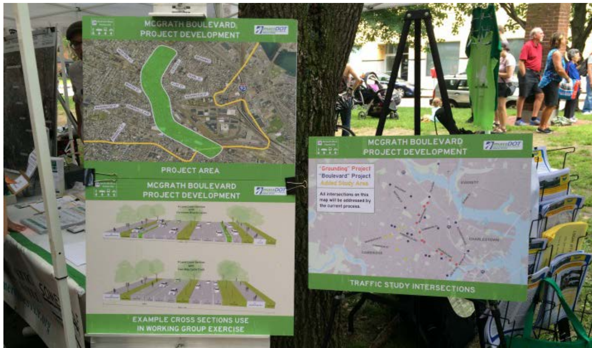
Photograph of project presentation boards showing maps and cross-sectional renderings of proposed configurations, set up in a public green rather than in a meeting room.

whether by producing materials in multiple languages or by augmenting presentations to highlight impacts on the neighborhoods to which they will be shown. If at a street fair, discuss walkability or noise mitigation. If at business event, discuss impacts on access and investment opportunities. Lean on relationships and build new ones. Trust that the community knows where you should be going, who to meet, where to spend energy. By visiting broader community events, planners and officials may be exposed to other topics that offer opportunities for collaboration or synergy.