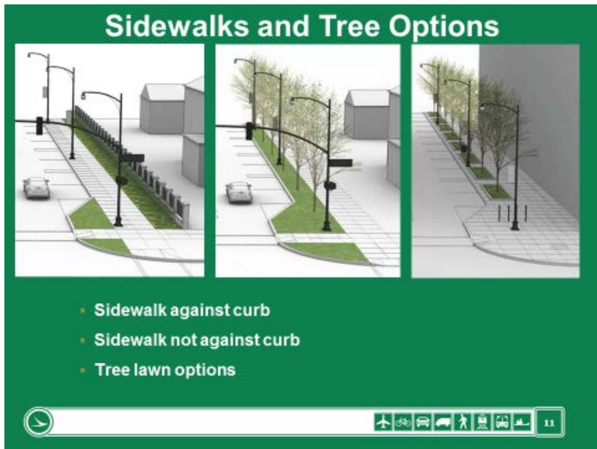
An image from an ODOT presentation during a public workshop showing a three different options for sidewalk and landscape configuration. Providing a set of pre-determined alternatives keeps community input focused on feasible, fiscally constrained options.